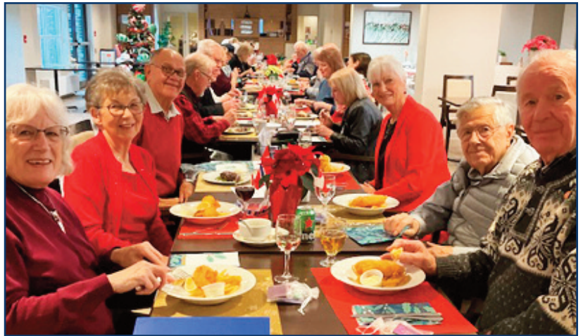
Viking Lodge Christmas Celebration from the other end of the table than on front page. Looks like they had a really good turnout!

doing this sort of thing, someone may seem to have been left out, but not intentionally. We will endeavour to make sure that those who have memberships of more than 50 years, receive their pins.