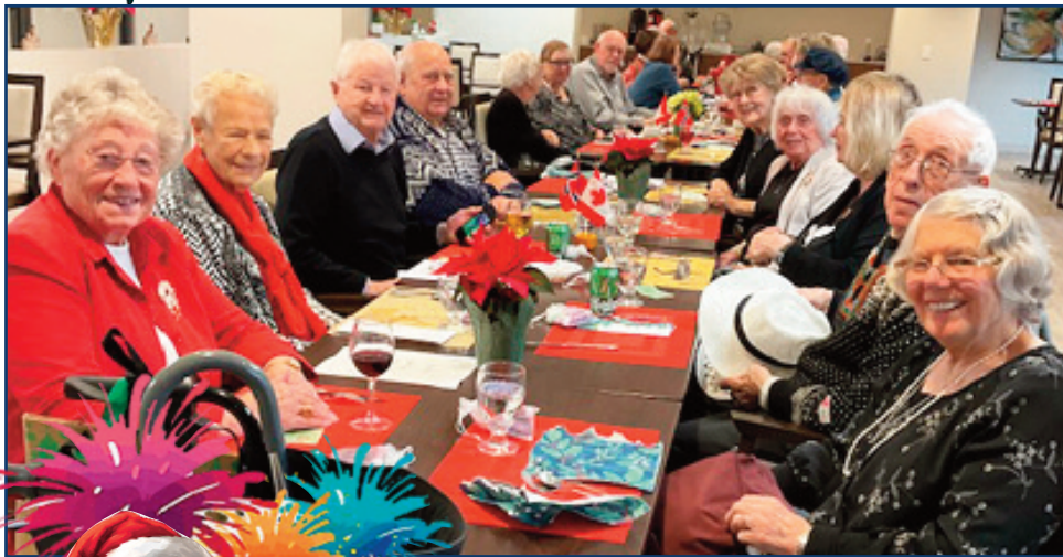
Viking Lodge members enjoying their Christmas Celebration