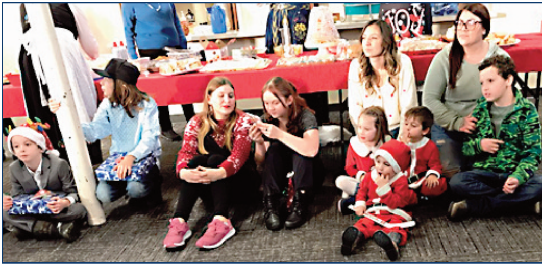
Kids waiting their turn to see Santa at Rondane Christmas Party,

members present. It was a Potluck party, starting at 11:30 am. We enjoyed singing Christmas Carols, while drawing names for the gifts we had bought for the occasion. The table, as usual, was loaded with so much food, and it was difficult not to taste absolutely everything.