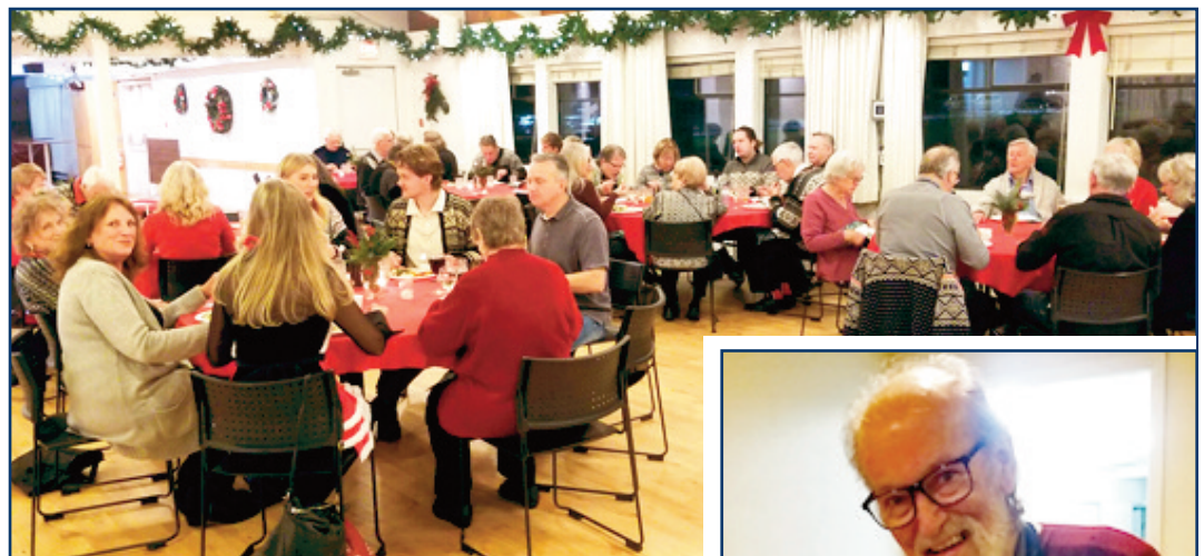
Sleipner Lodge celebrates Christmas.